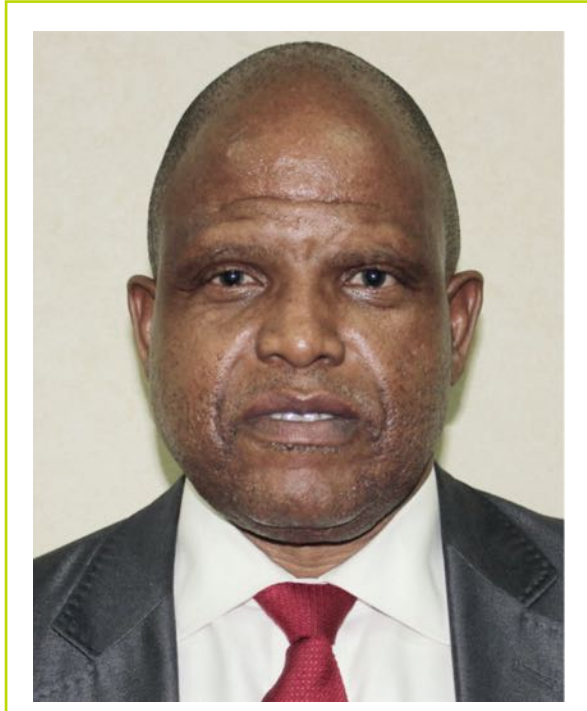
Honourable Mokoto Hloaele Minister of Energy & Meteorology

ith enormous impacts on the biophysical environment and socio – economic growth and development, climate change is one of the greatest global environmental challenges facing mankind.